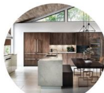
Sub-Zero Wolf keeps things cool and fresh in the kitchen.

"Sub-Zero Wolf's IW-30CI wine storage cooler (from $8,630) controls and maintains the perfect temp for all your whites, reds and even cheese. We are seeing more sophisticated households with an all-in-one cooler to help preserve space."